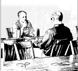
ACCOUNTABILITY WITH A PARTNER

Men share with the same partner each meeting their success/failure to implement their previous resolution.