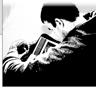
MAKE A MEASURABLE RESOLUTION

NOTE FOR PILOT SESSION: Read through and choose a resolution for this week from the suggestions below or make your own. A resolution should be active & measurable in your success/failure of accomplishing it.