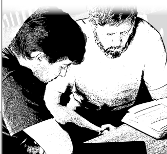
VOCAL PRAYER WITH A PARTNER

Men close with personal vocal prayer with a partner.